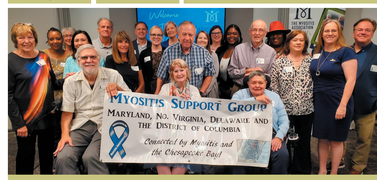
Local guests visited TMA headquarters during Myositis Awareness Month