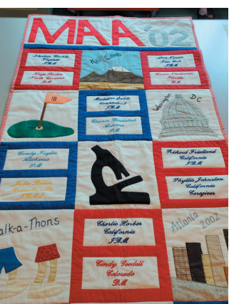
Handmade quilt from 2003 portraying TMA history!