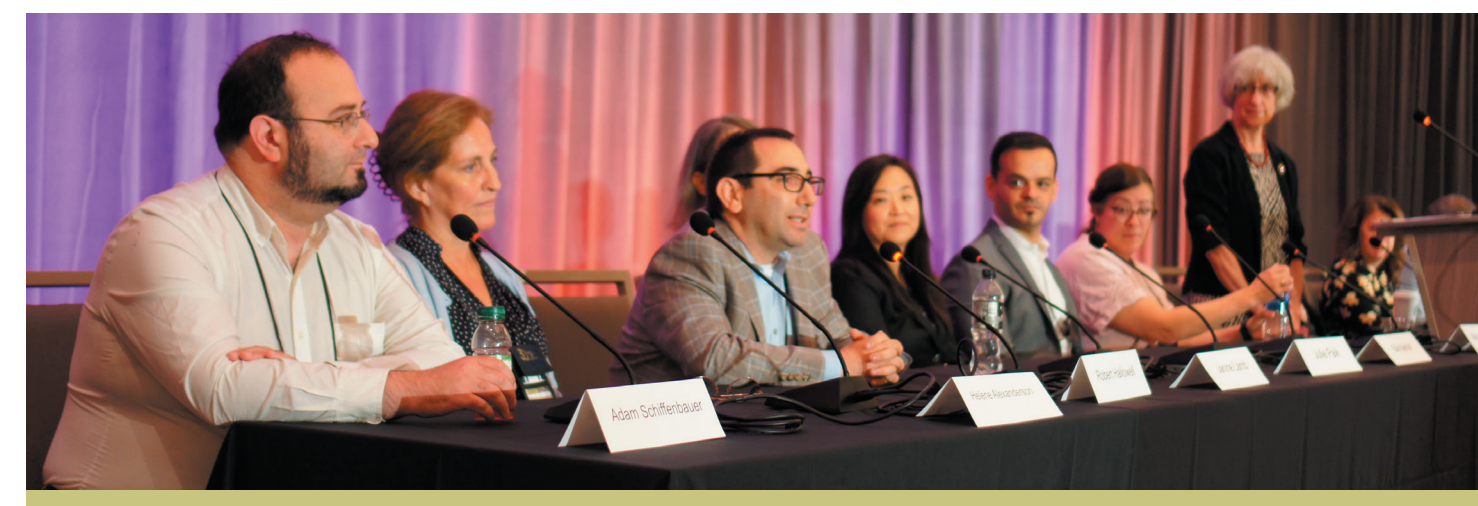
MAB Town Hall Q&A