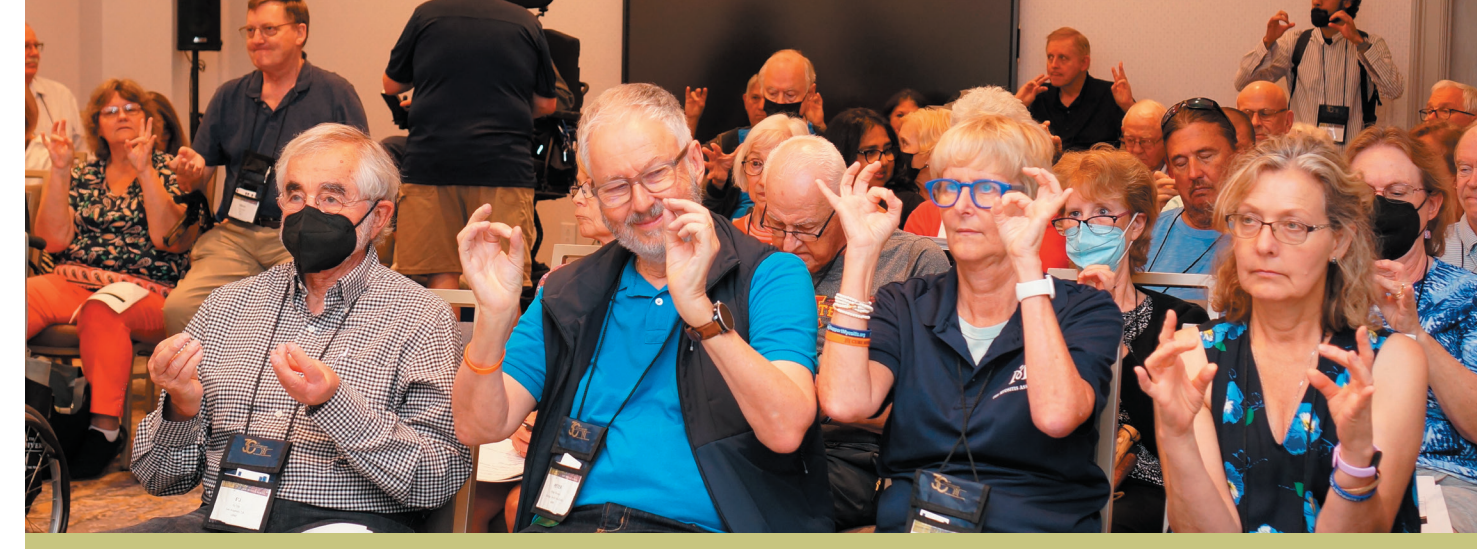
Attendees practice finger exercises