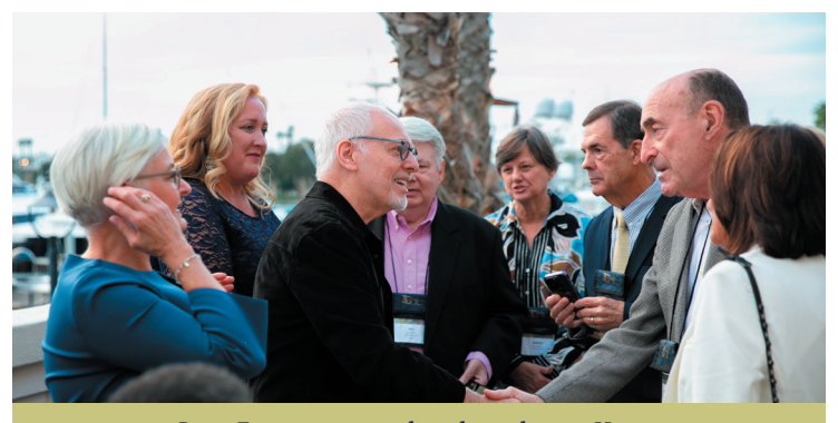
Peter Frampton greets board members at Heroes in the Fight Awards Reception