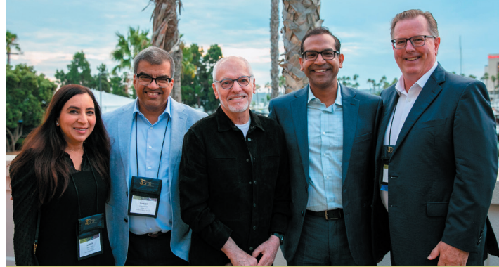
TMA's Heroes in the Fight Awardees