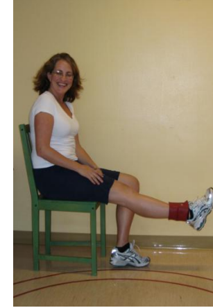
4. Strength knee extensors