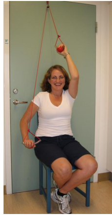
2. Shoulder mobility