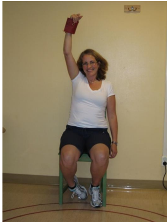
5. Strength shoulders