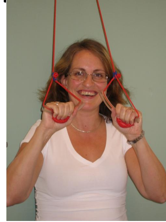
3. Grip strength