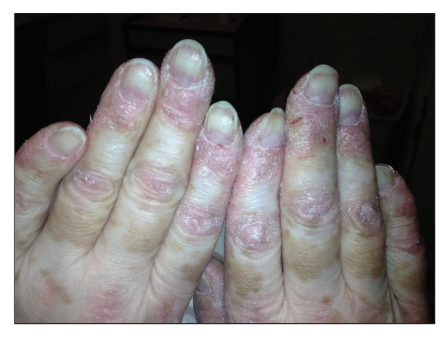
FIGURE 2. Gottron papules in amyopathic dermatomyositis with scaling of the dorsal aspects of the interphalangeal joints with an underlying purplish erythema. Surrounding poikilodermatous changes were visible.