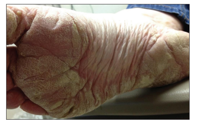
FIGURE 3. Plantar keratoderma with thick, white, hyperkeratotic plaques diffusely covering the sole.