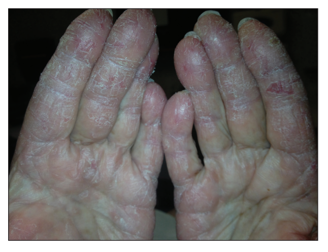
FIGURE 1. Mechanic's hands in amyopathic dermatomyositis with scaling of the lateral and volar surfaces of the digits as well as the palms.