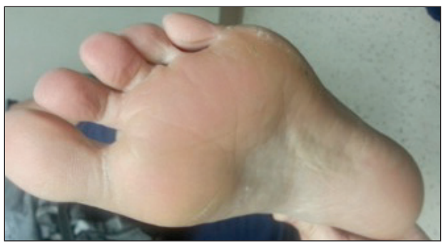
FIGURE 5. Plantar keratoderma resolved after 2 months of treatment with oral methotrexate.