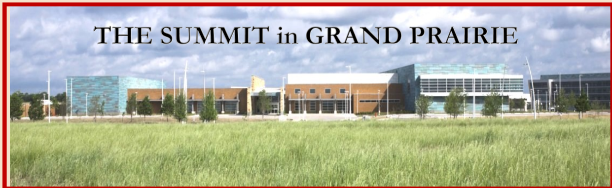
THE SUMMIT in GRAND PRAIRIE

At THE SUMMIT , Grand Prairie's wonderful multi- million dollar senior center. If you'd like a tour, or to make use of the pool or other of the facility, simply be in touch with Joe Sanchez, and plan to pay the $5 guest fee to the facility.