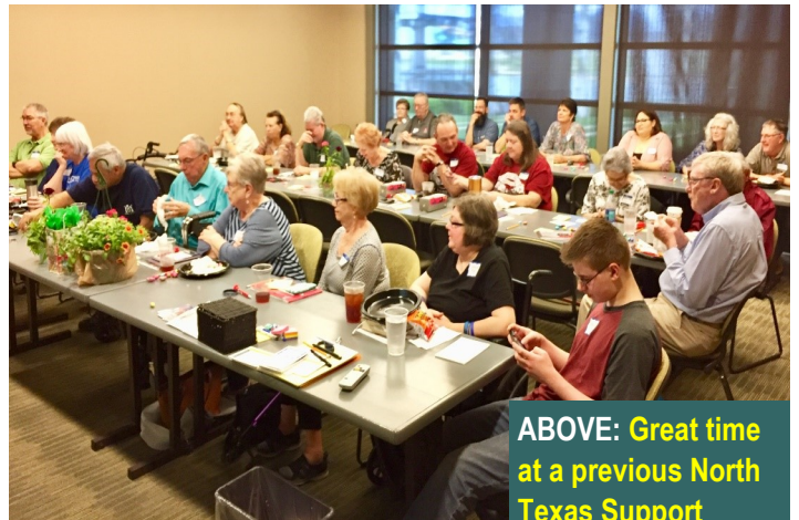
ABOVE: Great time at a previous North Texas Support Group Meeting!