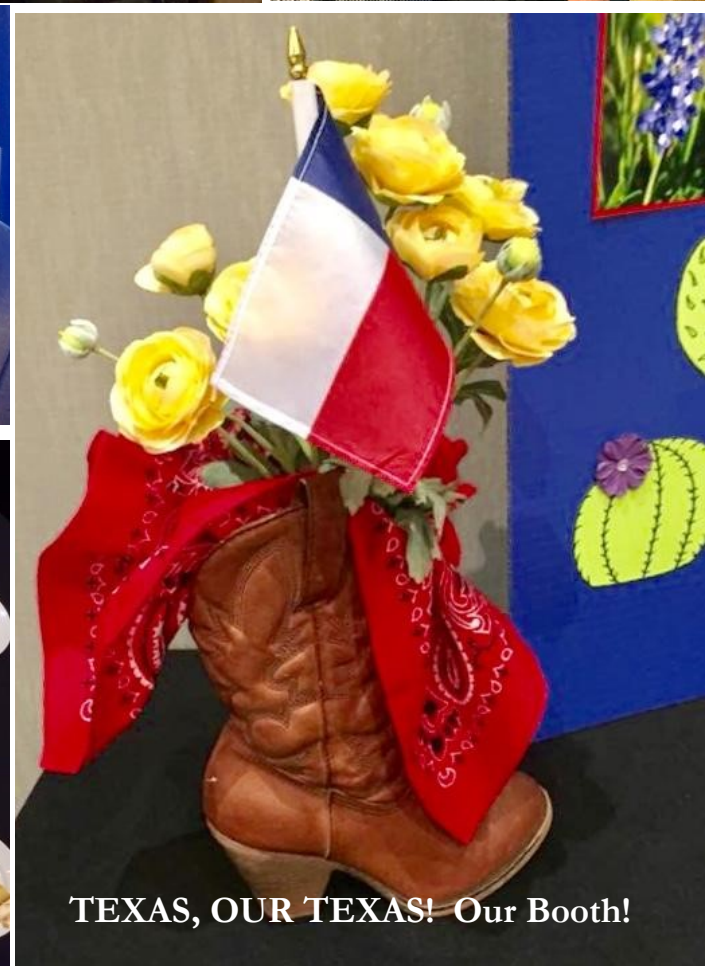
TEXAS, OUR TEXAS! Our Booth!