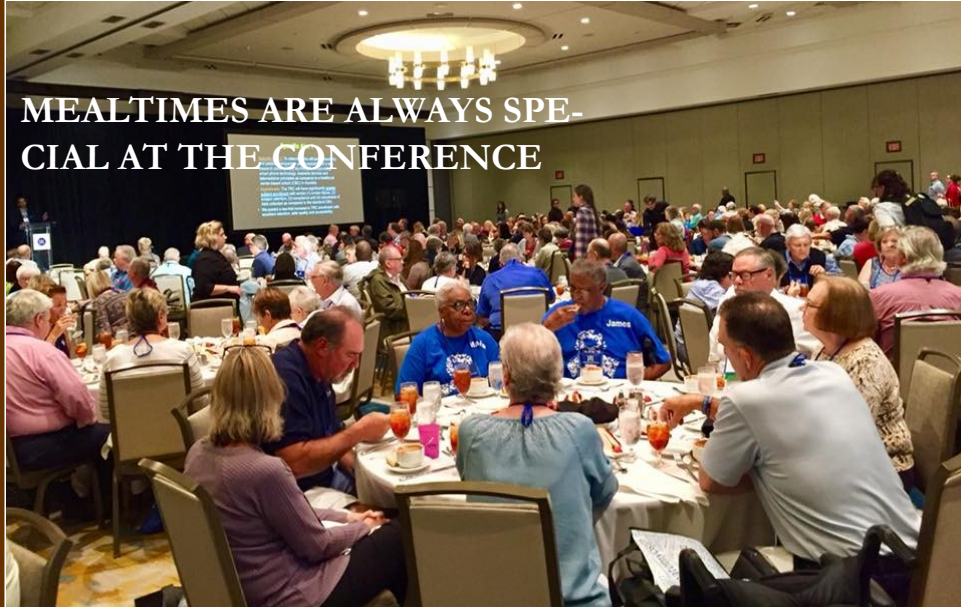
MEALTIMES ARE ALWAYS SPECIAL AT THE CONFERENCE