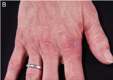
Figure 1 (A) Marked dermatitis involving sun-exposed areas of the trunk. (B) Gottron's papules overlying the knuckles.