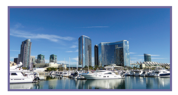
Sheraton San Diego Hotel and Marina