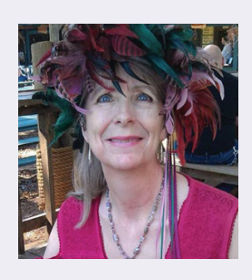
8 Myositis Awareness Month 2017