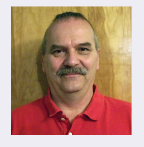
You are what you eat