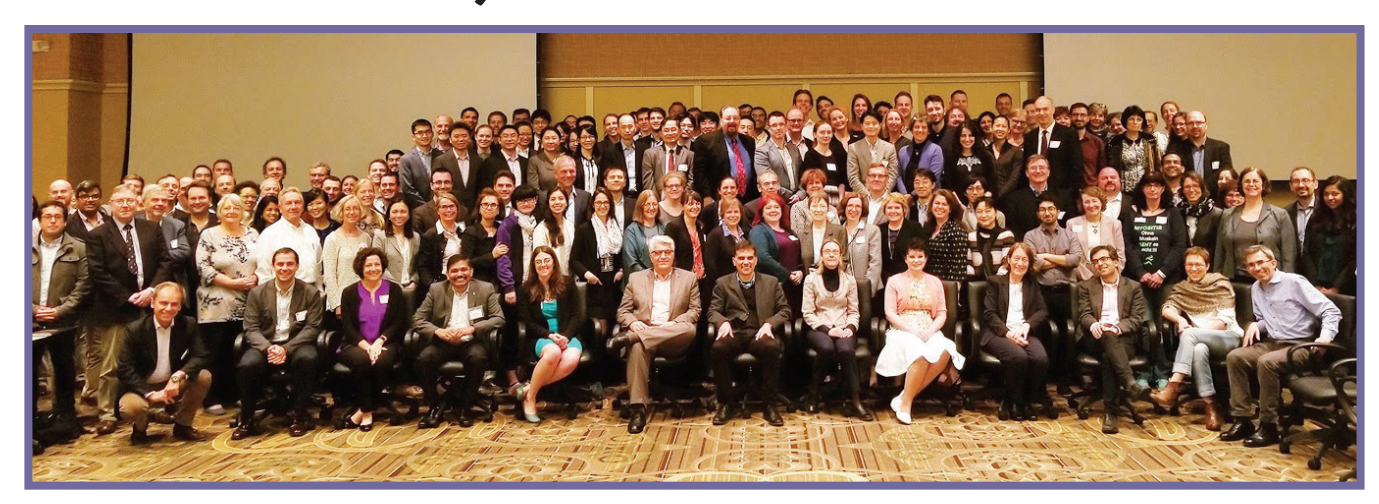
Global Conference on Myositis 2017

It was just a happy coincidence that, during Myositis Awareness Month in May, myositis experts from around the world gathered in Potomac, Maryland for the Global Conference on Myositis. This meeting, only the second of its kind in history, attracted more than 300 people from 22 countries, all of whom have an interest in understanding this rare disease and finding new, more effective treatments.