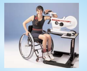
Strengthen the muscles you have. Exercise helps you stay as strong as you can. • Great for stretching • Built for hard use • Good for your heart • 5 models to choose from •

Regain and Maintain Your Stamina Saratoga™ "the Best"