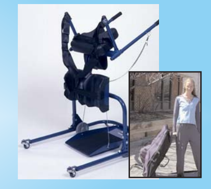
This Travel Lifter folds and is light! And, it works great with platform beds! Stop putting off travel! • 50 lbs. • carry case • fast set up •

Need A Lift When Traveling EasyPivot™ of course