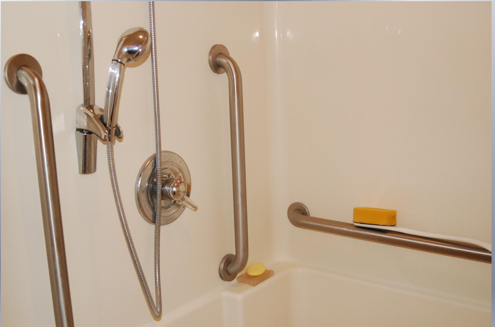
GRAB BARS/HAND HELD SHOWER SPRAY/LEVER STYLE CONTROLS/ LONG HANDLED BATH SPONGE