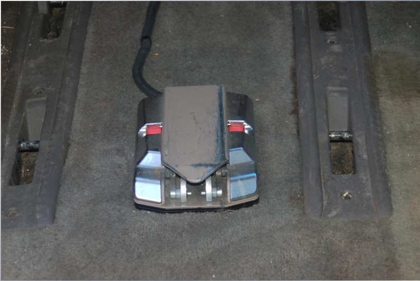
ELECTRONIC WHEELCHAIR LOCK