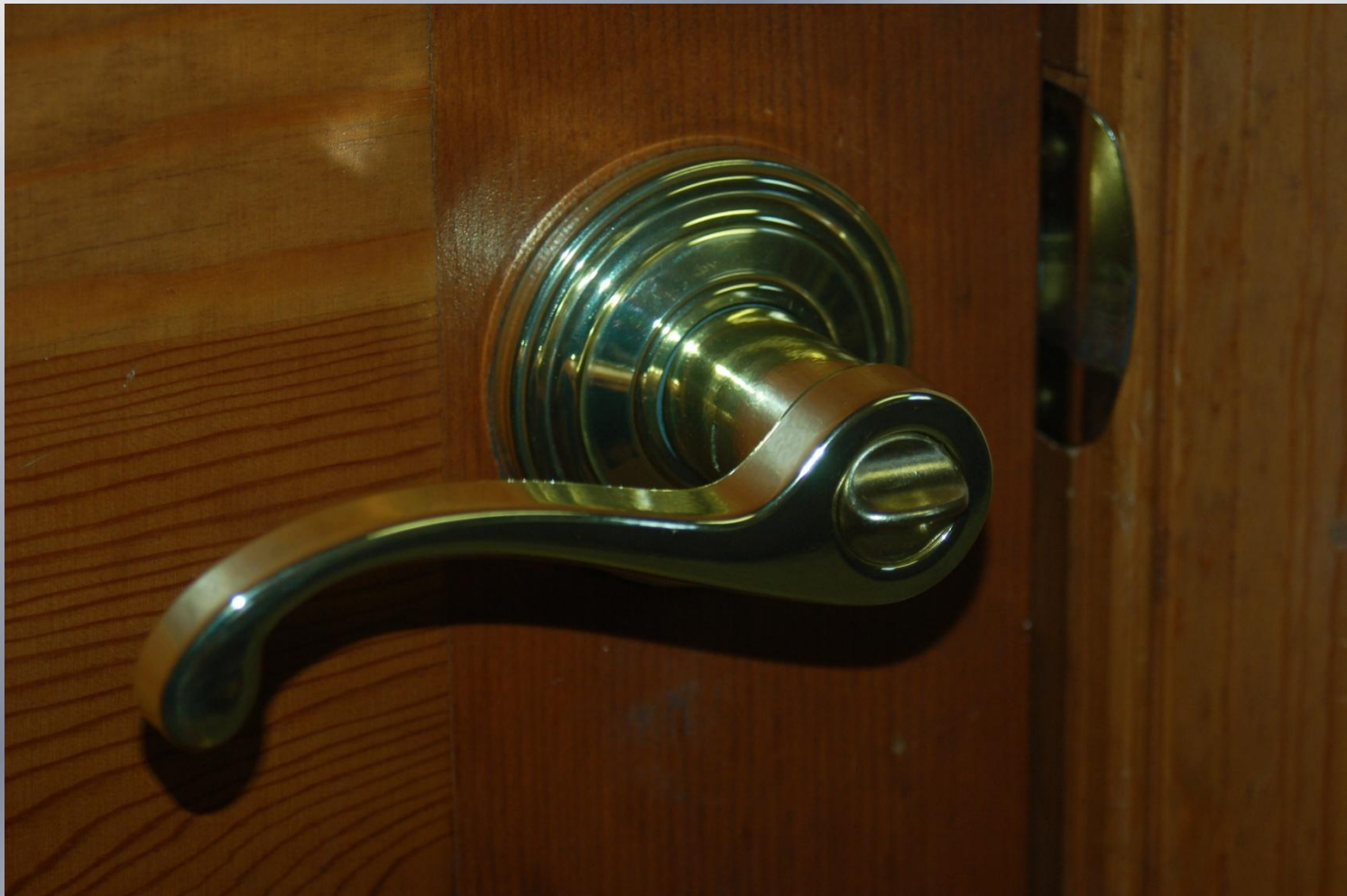
LEVER STYLE DOORHANDLES