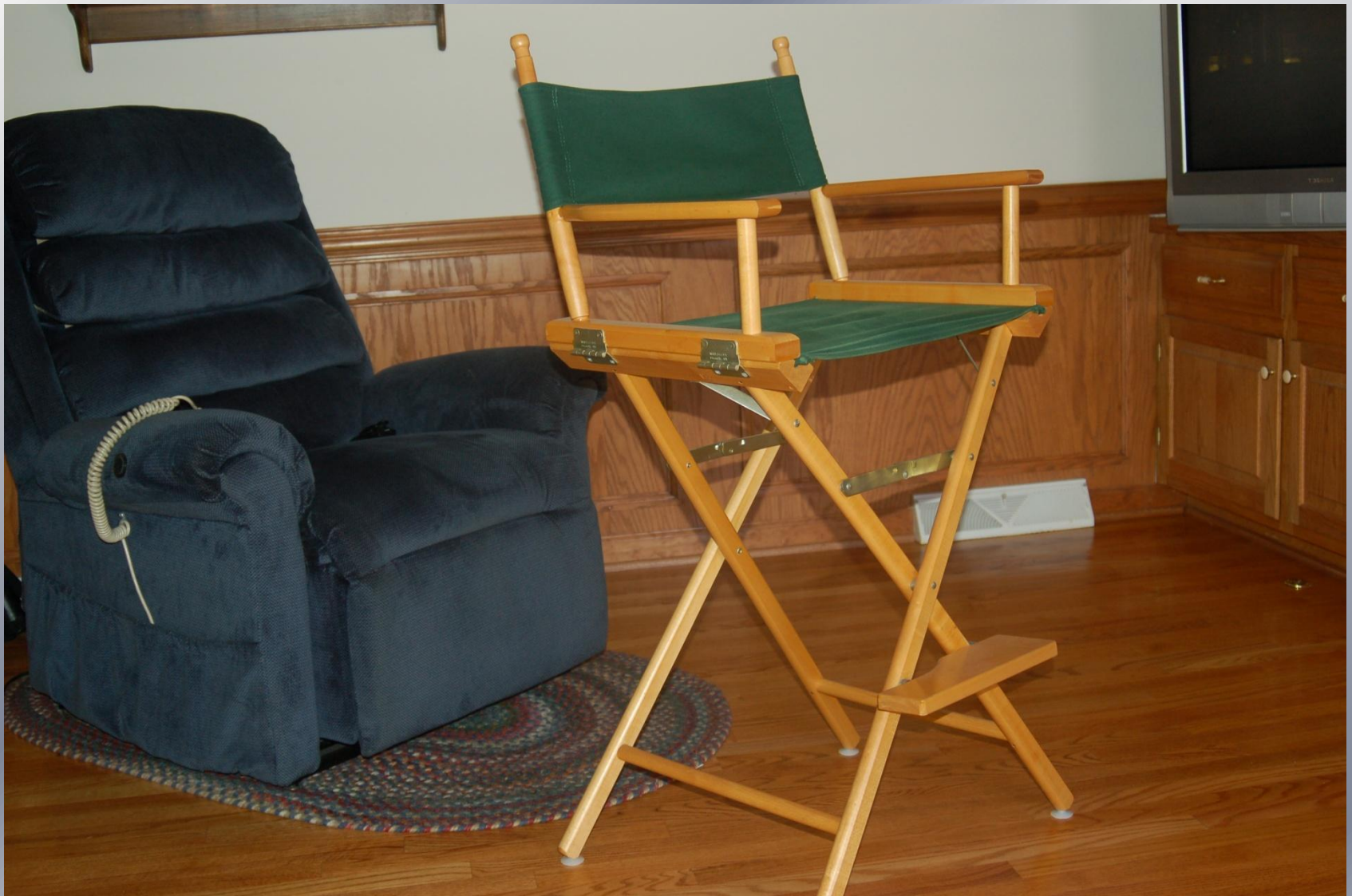
BARSTOOL HEIGHT DIRECTORS CHAIR