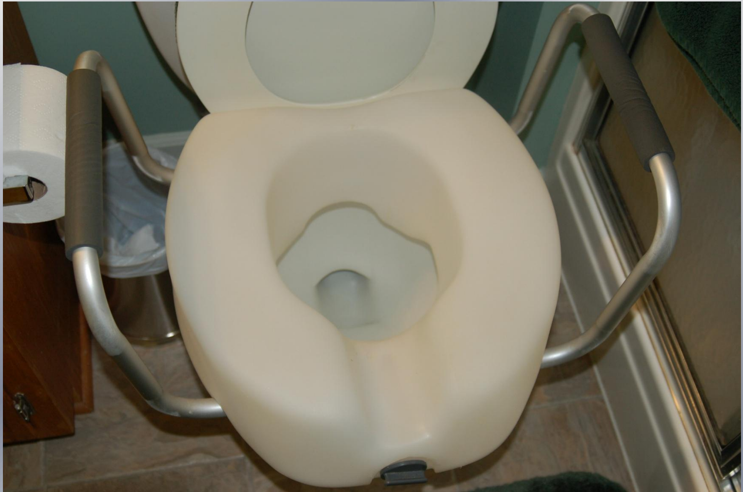
ELEVATED TOILET SEAT