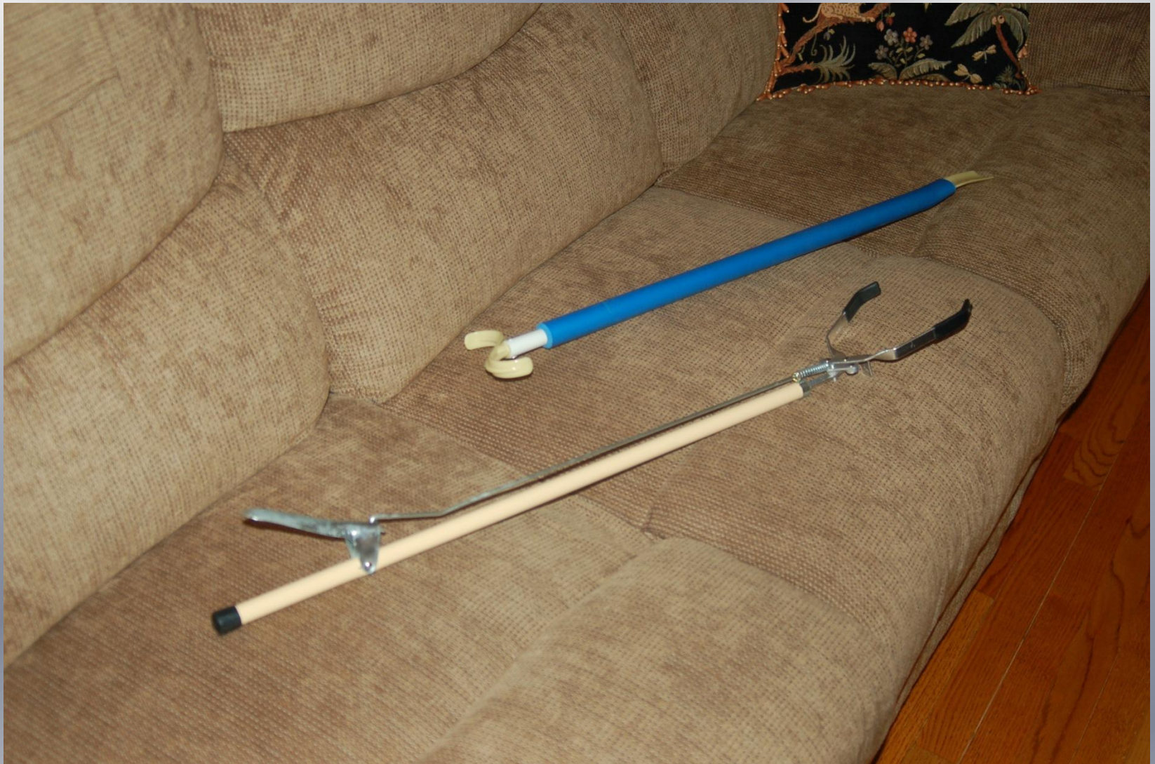
DRESSING STICK / REACH EXTENDER