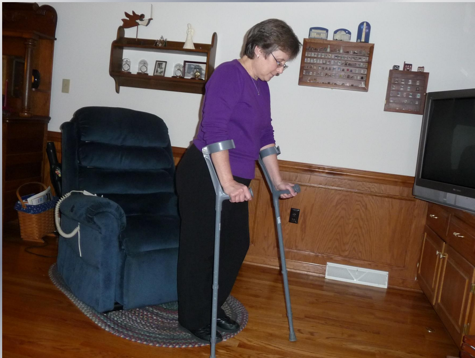
WALK-EASY ARM CRUTCHES