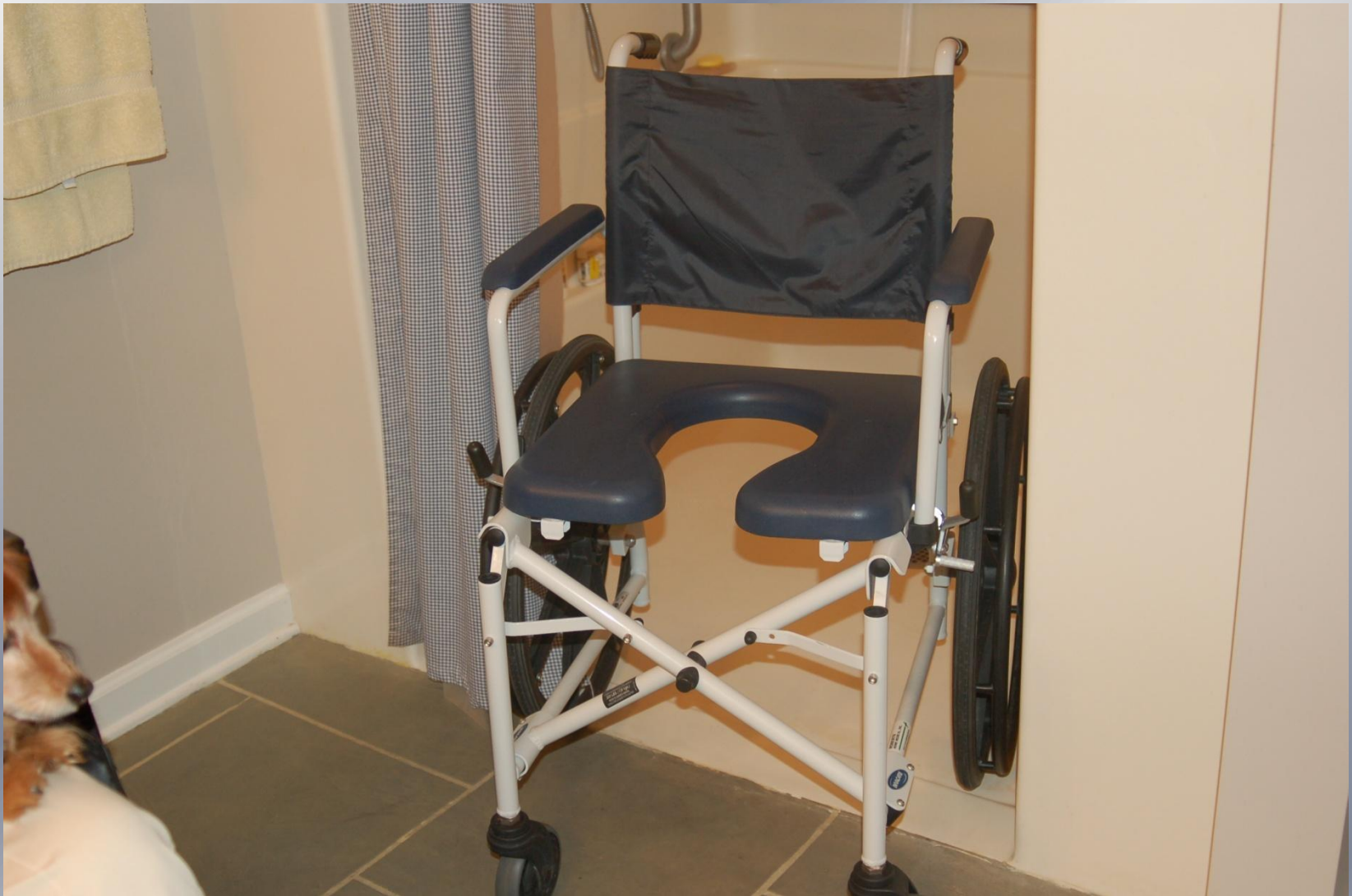
SHOWER CHAIR / ROLL-IN SHOWER